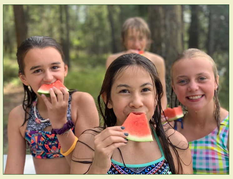
Grief Support • Grief Education • Counseling A Camp to Remember since 1997

Tamarack Grief Resource Center strengthens and honors individuals, families and communities throughout their journey with grief.